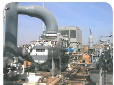
Figure 2. Leistriz twin screw pump in pipeline service.

In the not too distant past, heavy crude oil was recognised as uneconomical to produce and transport. These heavy crudes required unique production, transportation and processing technologies that were at the time considered pioneering. Today, that is not the case. Heavy oil producers operating in the harsh